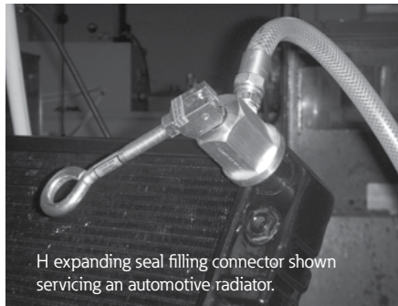
H expanding seal filling connector shown servicing an automotive radiator.