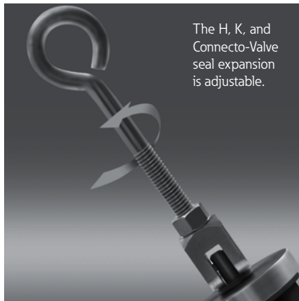
The H, K, and Connecto-Valve seal expansion is adjustable.