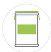
255 Kg DRUM