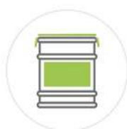
35 Kg DRUM